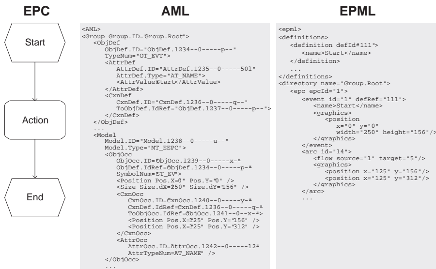
Figure 1: An example of AML and EPML representation of an EPC.